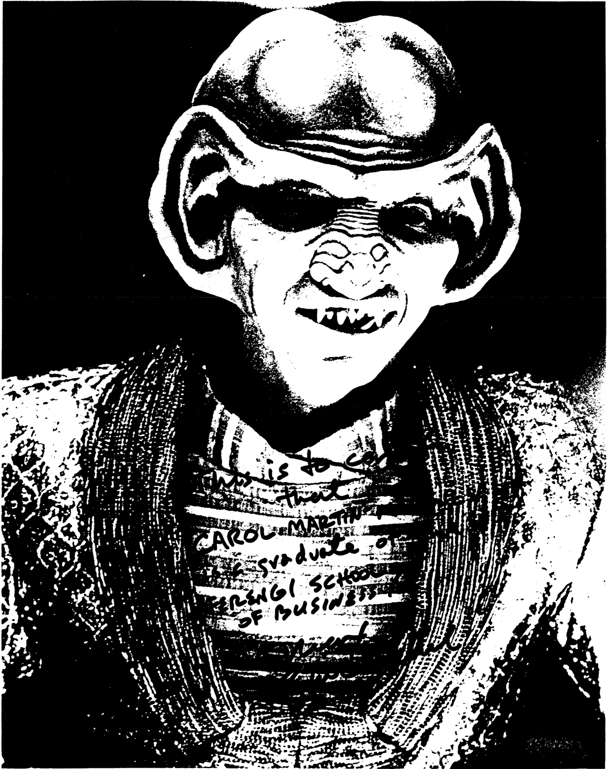
Max Grodénchik as Rom